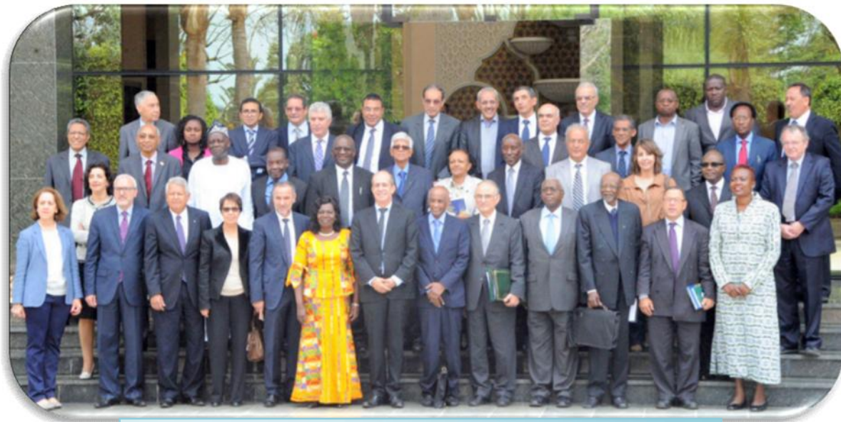
10th Anniversary of Hassan II Academy of Science and Technology and Technology

The NASAC Board members also had an opportunity to hold their fourth meeting during the celebrations.