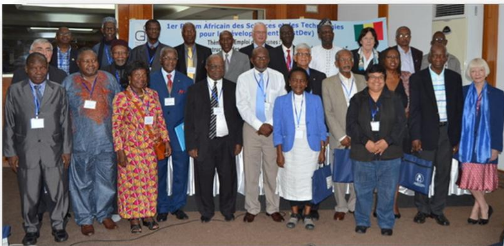
Participants at the FastDev Forum held in Dakar, Senegal 22-24 February 2016

The Groupe intercadémique pour le Développement (GID) and NASAC in collaboration with the Moroccan Academy (AHIIST), and the Senegalese Academy (ANSTS) hosted the First African Forum on Science and Technology for Development (FastDev) on the theme: " Youth employment: The necessary co-construction of teaching-training programs and enterprises ". ANSTS hosted this event with sponsorship of the Ministry of Higher Education and Research of Senegal (MESRI) and the French Academy of Sciences on 22 nd to 24 th February 2016 in Dakar, Senegal.