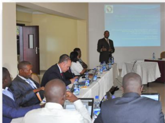
Communication Event on Harnessing Modern Agricultural Biotechnology for Africa's Economic Development 21-22 April 2016 Addis Ababa, Ethiopia

Participants at the meeting developed strategic points that would ensure the agribiotech policy booklet will be widely disseminated. Some of the suggested strategies included: