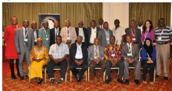
EXPERT PANEL WORKSHOP ON FOOD AND NUTRITION SECURITY AND AGRICULTURE IN AFRICA 5th - 10th May 2016, Hilton Hotel, Nairobi-Kenya

The two-day workshop exhaustively addressed the ten thematic areas with key recommendations or suggested actions necessary for the development of the policymakers' booklet. These were in line with the workshop's objectives, which were to: