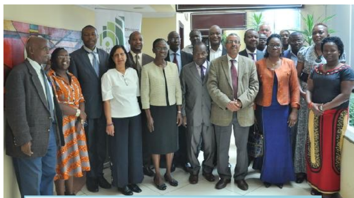
Participants at the Communication Event of the Agriculture Biotechnology Policy booklet