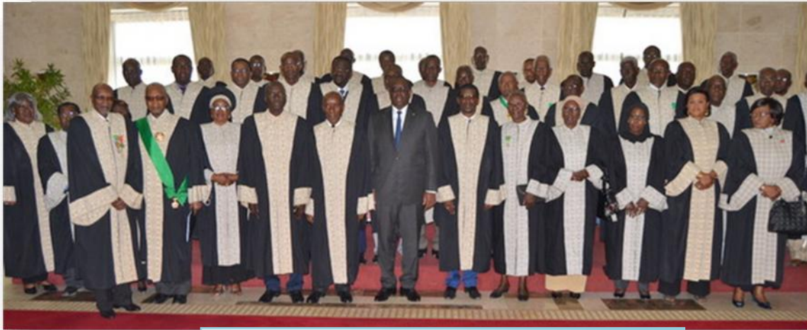
Members of the Academy At the center is the President of the Republic of Senegal