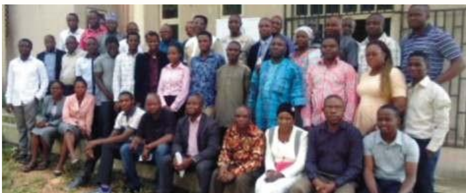
A cross-section of participants, facilitators and guests at the statistics workshop held at the Federal University of Technology, Akure.