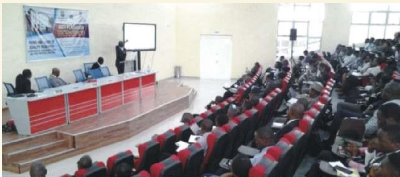
A cross section of speakers and participants at the Anti-Plagiarism Workshop held at Covenant University, Ota.