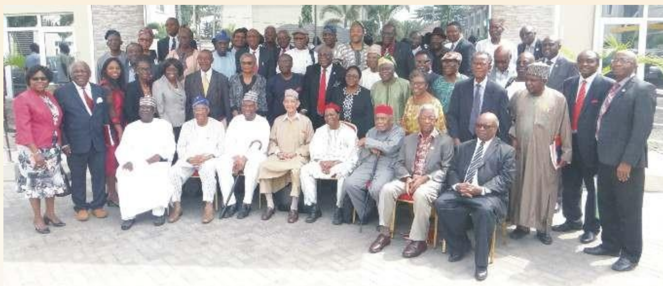
Fellows of the Academy at the Annual General Meeting held in January, 2018

Fellows of the Academy are scientists with diverse expertise covering all fields of science, including engineering and medicine. The Nigerian Academy of Science is merit-based and the growth of the Fellowship is limited by the rate of increase. The annual process of election of scientists into the Academy begins with a call for nominations which is sent to all Fellows of the Academy. To be elected, scientists have to be nominated by a Fellow of the Academy, and each nomination must be endorsed by three other Fellows. Subsequently, the nominations received are assessed by the appropriate Sectional Committees of the Academy, based on each candidate's field of expertise. The top three nominees, who must attain a stipulated minimum score, are recommended to the Council for shortlisting. The Council prepares the final short list of candidates to be voted for by Fellows of the Academy. The top ten candidates, with at least 50% of total votes cast, are elected.