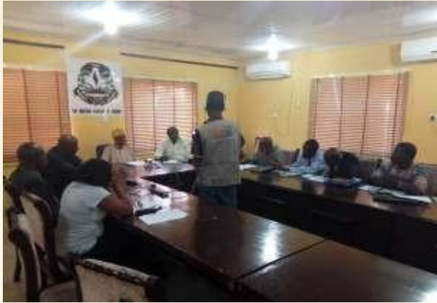
Participants at a Press briefing announcing the winner of the 2017 NAS Gold Medal of Science

The consensus statement, which represents the consensus views of tens of thousands of scientists, marks the first time Commonwealth nations have come together to urge their