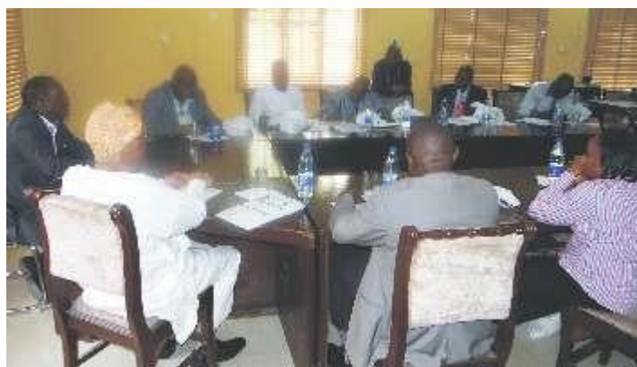
Journalists at NAS's Press briefing