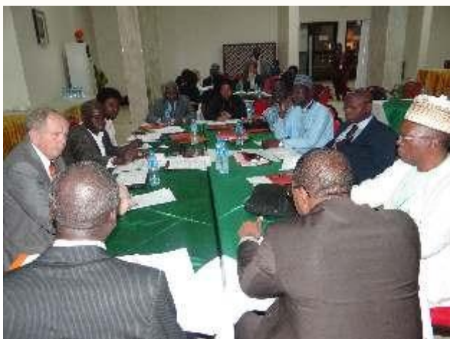
Session participants at the ICSU Stakeholders Workshop