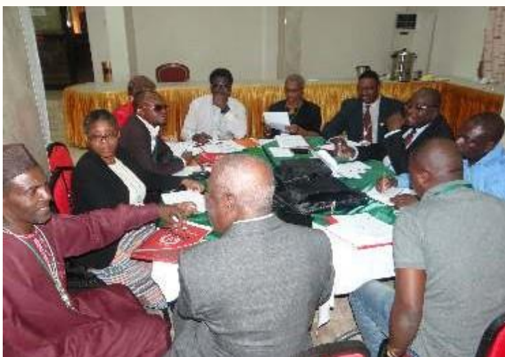
Session participants at the ICSU Stakeholders Workshop

This section provides a brief overview of some international events/activities, involving the Academy during the course of 2018