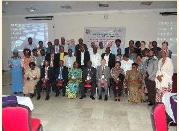
Participants at the ICSU Stakeholders Workshop hosted by NAS

The Nigerian Academy of Science (NAS) held its 8th Science Media Award Dinner on Tuesday, 23rd October, 2018 at Sheraton Hotel and Towers, Ikeja Lagos. This was held in collaboration with Vitafoam Nigeria plc. NAS had entered into agreement with Vitafoam Nigeria Plc earlier in the year. The relationship is to maximise the benefits of science and increase awareness of such benefits which would result in increased support for development and application of science in the society.