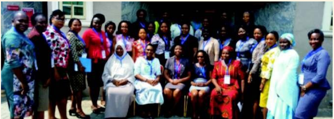
A cross section of some female participants at the Capacity Building Workshop for Young Women (Early-Career) Academics in West Africa held at Yaba, Lagos.