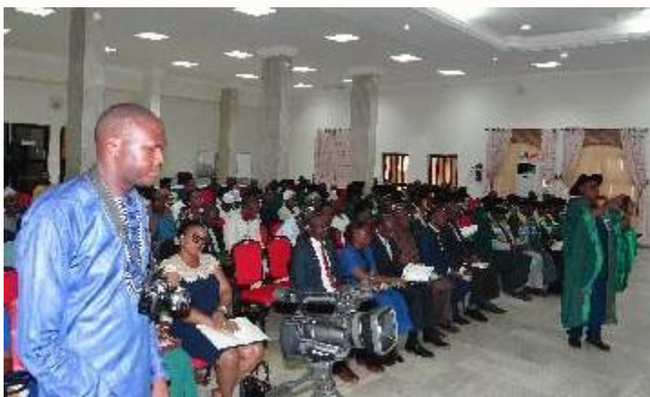
Cross section of participants at the 2017 NAS Gold Medal of Science Lecture