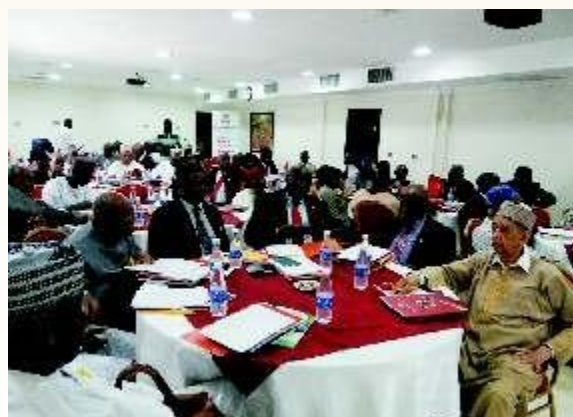
Cross section of NAS Foundation Fellows and Past Presidents at the Academy's Annual General Meeting

They were to be inducted as Fellows of the Academy in May, 2017 at Abuja.