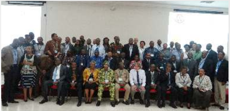
Some International participants pose with members of the Nigerian Academy of Science at the celebration of its 40th Anniversary

Participants included scientists from African academies of science, policymakers, as well as international development partners. Other participants included young scientists who were grantees of LIRA (Leading Integrated Research in Africa) programme of the International Council for Science (ICSU) and the Network for African Science Academies (NASAC), inter-government and non-governmental organizations, researchers and research administrators.