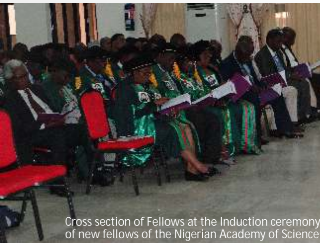
Cross section of Fellows at the Induction ceremony of new fellows of the Nigerian Academy of Science