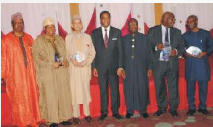
Some Past Presidents of the Academy displays their plaque of stewardship to the audience at the NAS anniversary dinner.

Tuesday, 14th of November, 2017 in Abuja. The symposium with the theme, "The evolution of the Nigerian Academy of Science (NAS), and its role in the science-policy dialogue/nexus" had in attendance Fellows of the Academy, representatives of the national academies in Africa, well as policymakers, and other stakeholders.