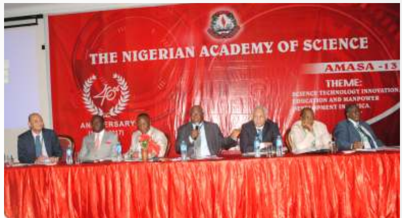
Members of the high table at the AMASA-13 conference hosted by the Nigerian Academy of Science in Abuja

The Academy hosted the 13th Annual Meeting of African Science Academies (AMASA-13) in Abuja on the 15th and 16th of November, 2017. The scientific conference was titled 'Science, Technology and Innovation: Education and Manpower Development in Africa'. The Chairman, Senate Committee on Science and Technology, Professor (Senator) Robert Boroffice in his opening address discussed the solutions to STI education and manpower