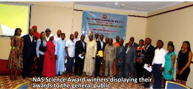
NAS Science Award winners displaying their awards to the general public