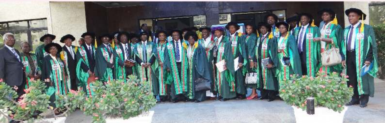
Fellows of the Nigerian Academy of Science at the induction of new Fellows in Abuja

The Nigerian Academy of Science held its annual general meeting in Lagos on Thursday, 28 th of January, 2016. At the meeting, the Academy's 40 th Council was reconstituted.