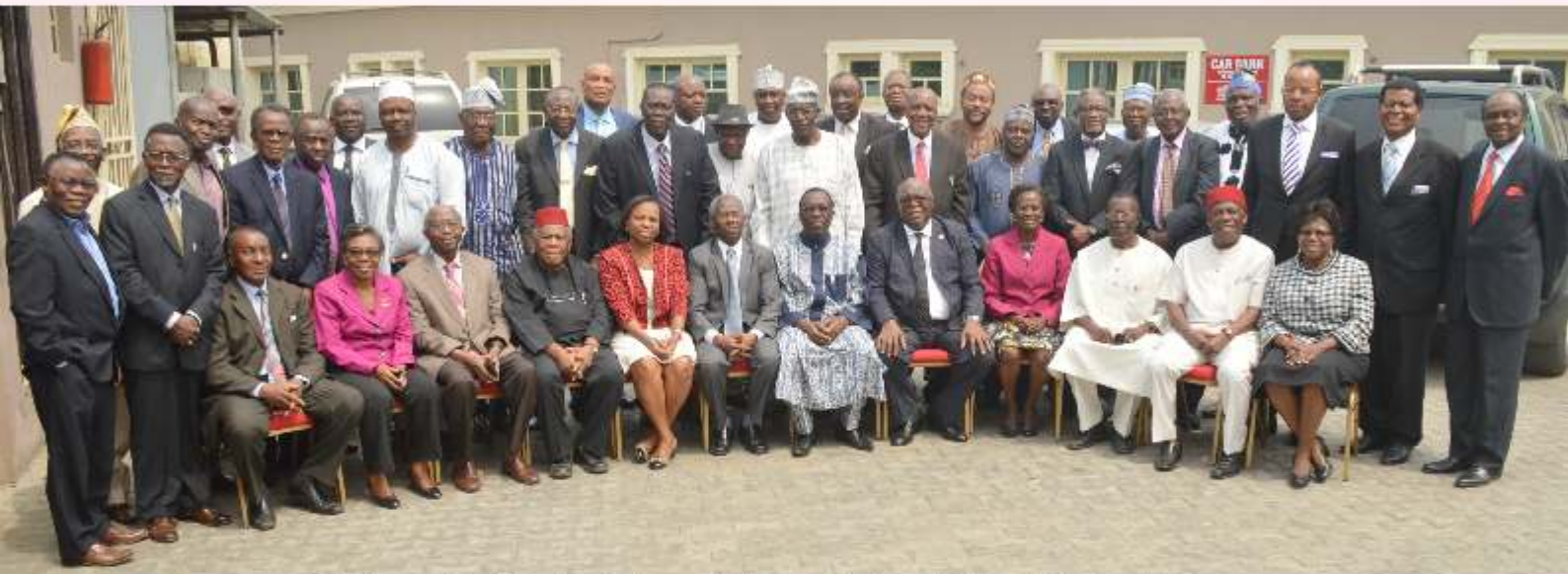
Fellows of the Nigerian Academy of Science at its Annual General Meeting in Lagos

Fellows of the Academy are scientists with diverse expertise covering all fields of science, including engineering and medicine. The Nigerian Academy of Science is merit-based and the growth of the Fellowship is limited by the rate of increase. The annual process of election of scientists into the Academy begins with a call for nominations which is sent to all Fellows of the Academy. To be elected, scientists have to be nominated by a Fellow of the Academy, and each nomination must be endorsed by three other Fellows. Subsequently, the nominations received are assessed by the appropriate Sectional Committees of the Academy, based on each candidate's field of expertise. The top three nominees, who must attain a stipulated minimum score, are recommended to the Council for shortlisting. The Council prepares the final short list of candidates to be voted for by Fellows of the Academy. The top ten candidates, with at least 50% of total votes cast, are elected.