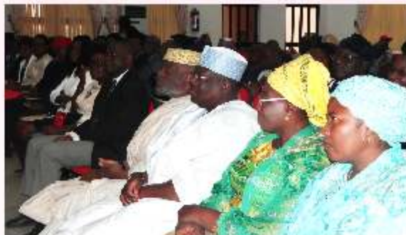
Cross section of dignitaries at the public lecture on 'The battle against transboundary animal diseases in Nigeria and some west African countries' held in Abuja