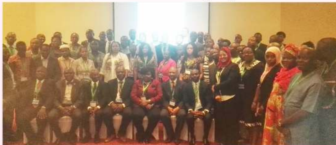
Participants at the TWAS-ROSSA Young Scientist's Conference and 6th General Assembly of The Nigerian Young Academy (NYA) jointly hosted by NAS on the 23rd and 24th of August, 2016 in Lagos.

The Nigerian Academy of Science and The World Academy of Science Regional Office for Africa (TWAS-ROSSA), on the 23rd and 24th of August, 2016 collaborated with the Nigerian Young Academy (NYA) in Lagos to host the Young Scientists Regional Conference themed "Inclusive growth and sustainable development in Africa: The role of young academies".