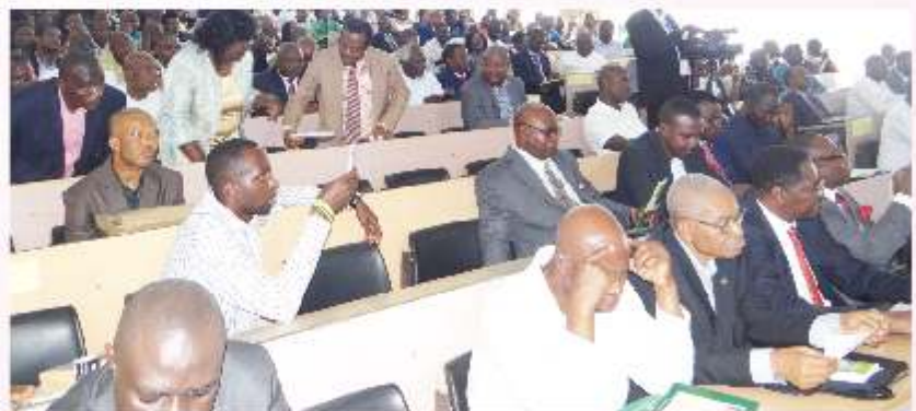
Cross section of participants at the public lecture on 'Source Rocks and Sorcerers: Decoding the origin of the Niger Delta Petroleum' held in collaboration with Federal University of Petroleum Resources, (FUPRE) Effurun, Delta State