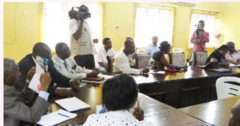
Cross section of journalists at the media roundtable on Genetically Modified Organisms (GMO) in Nigeria held in Lagos

Participants included scientists from different institutions in Nigeria and representatives of some key professional associations and institutions, stakeholders from the Science Association of Nigeria, the Nigerian Young Academy (NYA), and some Fellows of the Nigerian Academy of Science