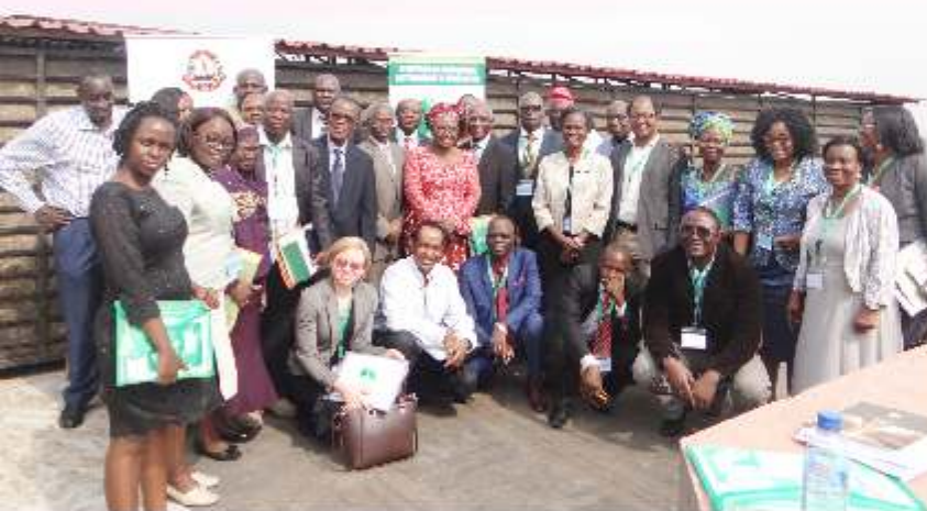
Participants at the stakeholders roundtable on Genetically Modified Organisms (GMO) held in Lagos

The application and regulation of Genetically Modified Organisms (GMOs) is one of the most highly debated issues globally. These organisms have several potential applications, especially in agriculture, medicine, and industry.