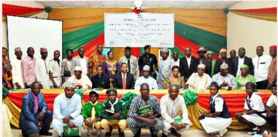
Group picture with students at the Family Life and Health Education (FLHE) launch in Nassarawa State on the 6th of September,2016