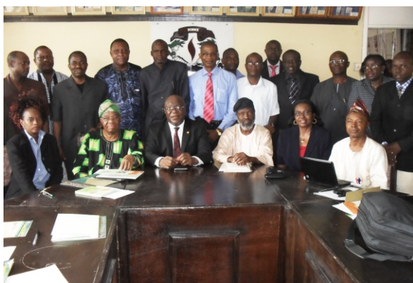
Representatives of national science associations at a meeting with NAS leadership at the NAS secretariat

In a bid to foster a closer working relationship with the national science associations in the country, NAS invited the representatives of the associations to a meeting at the NAS secretariat on the 28th of April 2011. The meeting discussed the need to work together to develop science, technology and innovation in the country. The representatives expressed their delight and willingness to collaborate more with NAS as the peak independent scientific body in the country. They also asked that this becomes a regular event that will ensure that the scientific community speaks with one voice to the government.