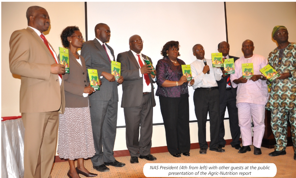
NAS President (4th from left) with other guests at the public presentation of the Agric-Nutrition report