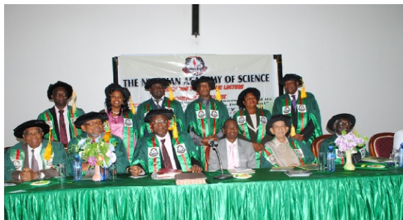
Newly inducted Fellows (standing) with members of the high table