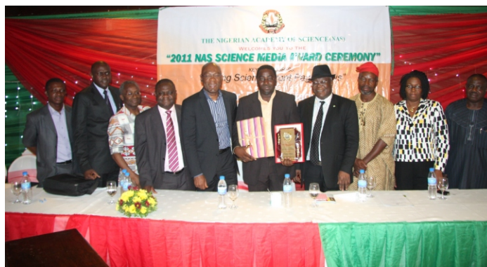
Media award-use caption as in newsletter