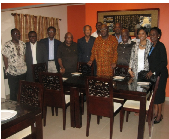
NAS delegates meet their Ghanaian counterpart at a meeting to discuss mutual collaboration between both institutions

NAS continued to forge ahead in ensuring that the Nigerian science community is appropriately represented at important international science gatherings. The Academy has also continued her effort to build strong relationships with other academies and international institutions. Some highlights of NAS' international engagements are below: