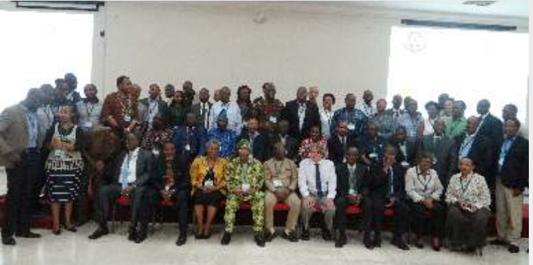
Science at the celebration of its 40th Anniversary

Participants included scientists from African academies of science, policymakers, as well as international development partners. Other participants included young scientists who were grantees of LIRA (Leading Integrated Research in Africa) programme of the International Council for Science (ICSU) and the Network for African Science Academies (NASAC), Some International participants pose with members of the Nigerian Academy of inter-government and non-governmental organizations, researchers and research administrators.